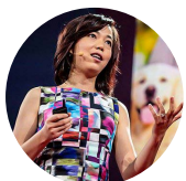
Fei-Fei Li Stanford University Sequoia Professor of Computer Science