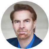
Erik Brynjolfsson Stanford University Senior Fellow at the Stanford Institute for Human-Centered AI (HAI)