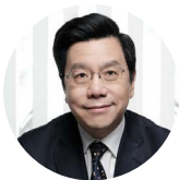
Kai-Fu Lee Sinovation Ventures President & CEO