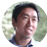
Andrew Ng Landing AI Founder & CEO