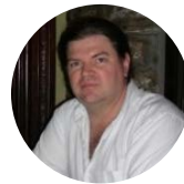
Yann LeCun Facebook VP & Chief AI Scientist