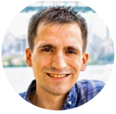
Kyle Wiggers VentureBeat Staff Writer