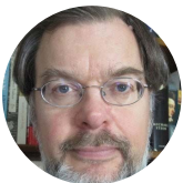
Gil Press Forbes Columnist & Blogger