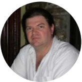
Yann LeCun Facebook VP & Chief AI Scientist