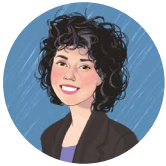
Meredith Whittaker AI Now Institute Co-Founder & Faculty Director

This sample highlights individuals that are working in education and/or research the topic of AI. These people publish research on AI, and are active members within the online AI conversation.